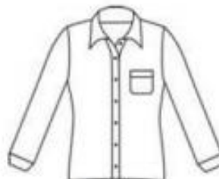
Shirts and Blouses

Shirt - White School Blouse or White School shirt must be able to be buttoned up to the collar. Long or short sleeved allowed.