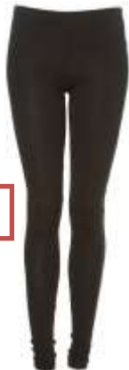
Leggings / Jeggings