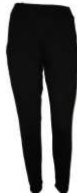
Harem / Baggy Trousers