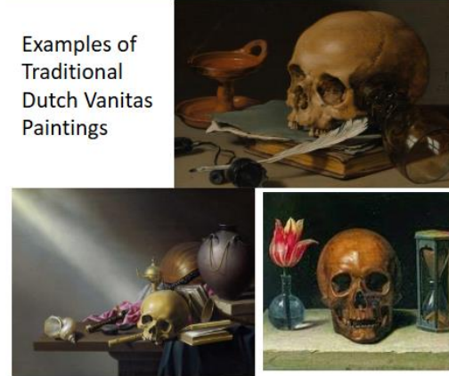
Examples of Traditional Dutch Vanitas Paintings

STILL LIFE The subject matter of a still life painting is anything that does not move or is Dead.