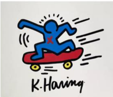
Keith Allen Haring was an American artist whose pop art emerged from the New York City graffiti subculture of the 1980s. His animated imagery has "become a widely recognized visual language".

Practice your observational drawing skills by copying this Keith Haring character into the box below.